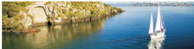
Lake Cruises & Maori Carvings