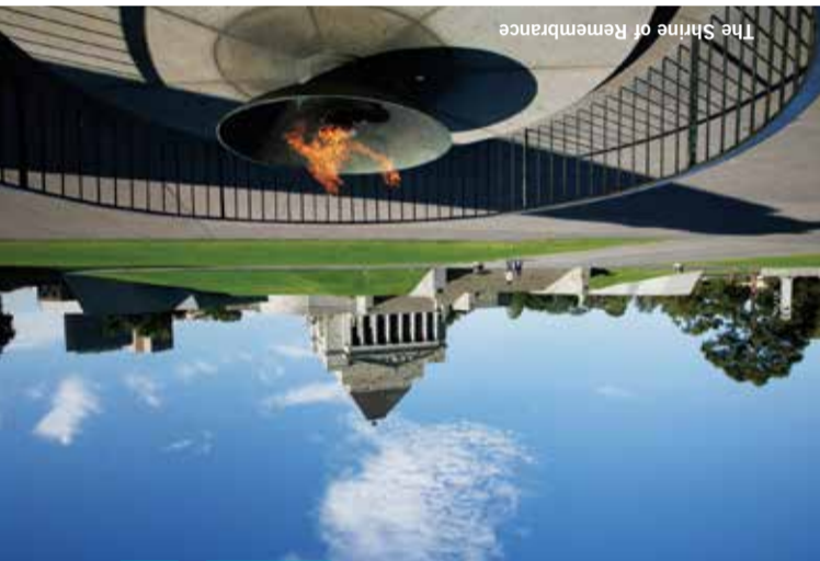
The Shrine of Remembrance

Discover the history of Melbourne's multicultural society at the Immigration Museum , or learn more about indigenous culture past and present at the Koorie Heritage Trust Cultural Centre . William Street is also home to Melbourne's biggest legal institutions, including the Law Courts , Supreme Courts and the County Court . Take in some impressive architecture at the ANZ Gothic Bank or wander down to the waterfront at Enterprise Wharf and explore the amazing underwater world of Melbourne Aquarium .